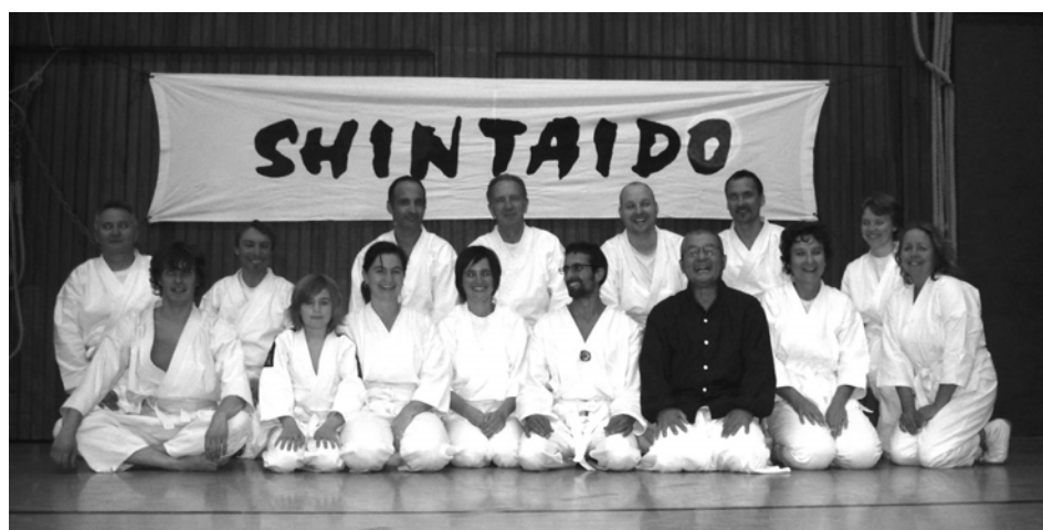
Wipperfürth, Gasshuku 2007